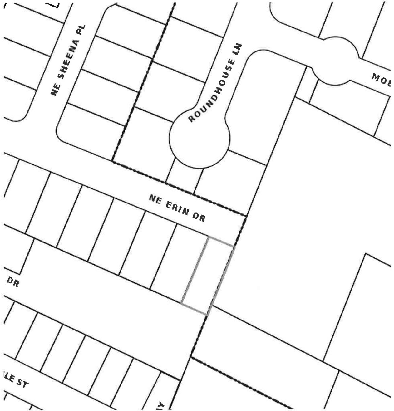
Exhibit "2" Map